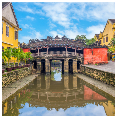
Japanese Covered Bridge