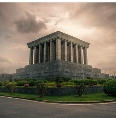
Ho Chi Minh Mausoleum