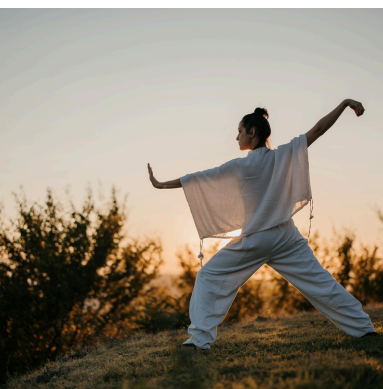
Tai Chi Exercises