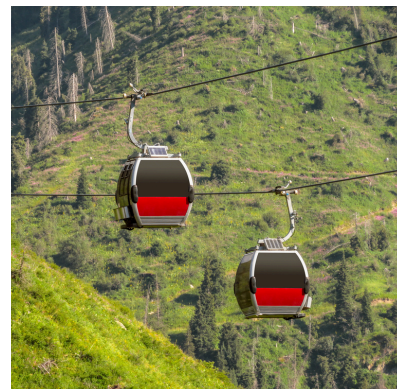
Cable Car Ride