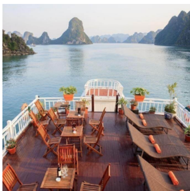
Halong Bay Cruise