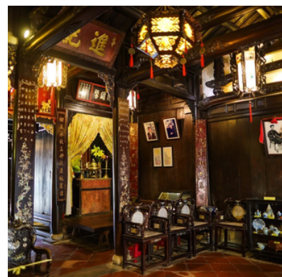
Tan Ky Traditional House