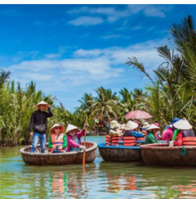
Cam Thanh Coconut Village