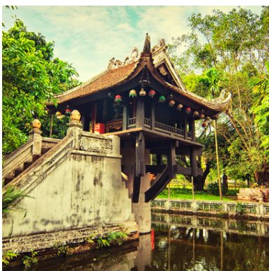
One pillar pagoda