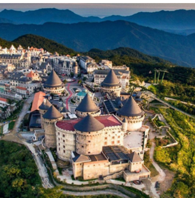
Ba Na Hills