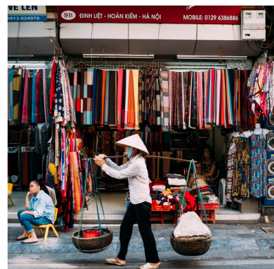
Hanoi Old Quarter