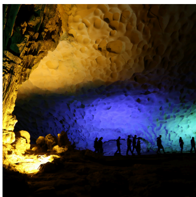
Sung Sot Cave